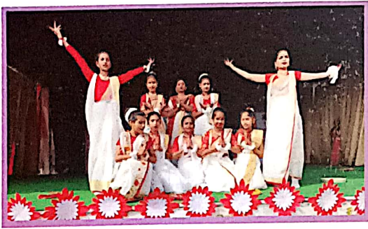
Red & White Day Celebration