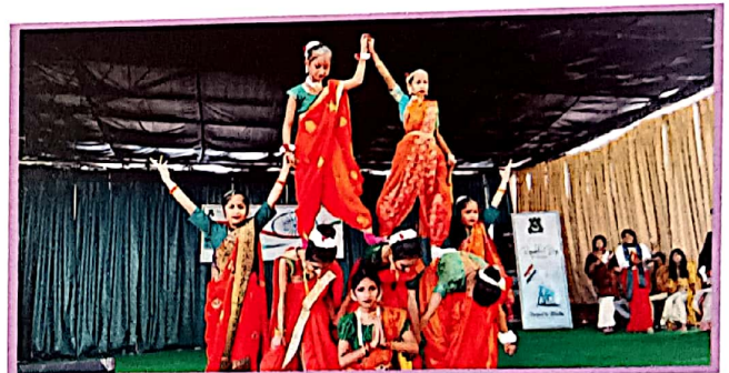
Republic Day Celebration